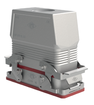
180 °C series

Enclosures with a conductive coating and special conductive gaskets assuring highly effective EMC shielding.