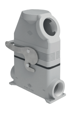
CENTRAL LEVER series

Plenty of space to allow easy wiring and even the installation of P.C. boards inside the hood. The ideal solution for XXL needs.